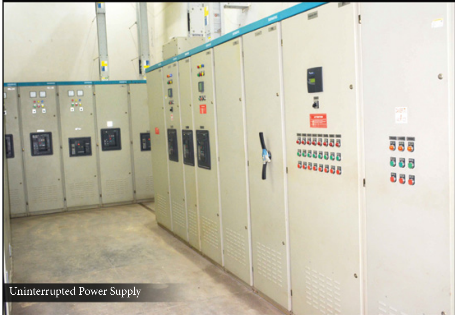
Uninterrupted Power Supply