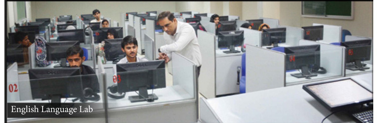
English Language Lab