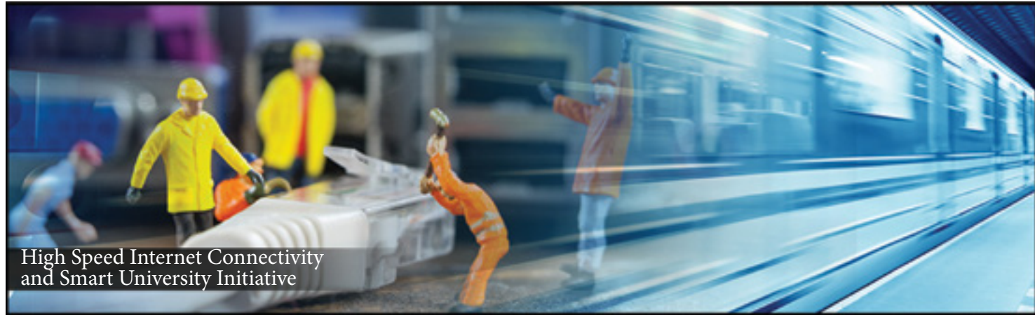
High Speed Internet Connectivity and Smart University Initiative